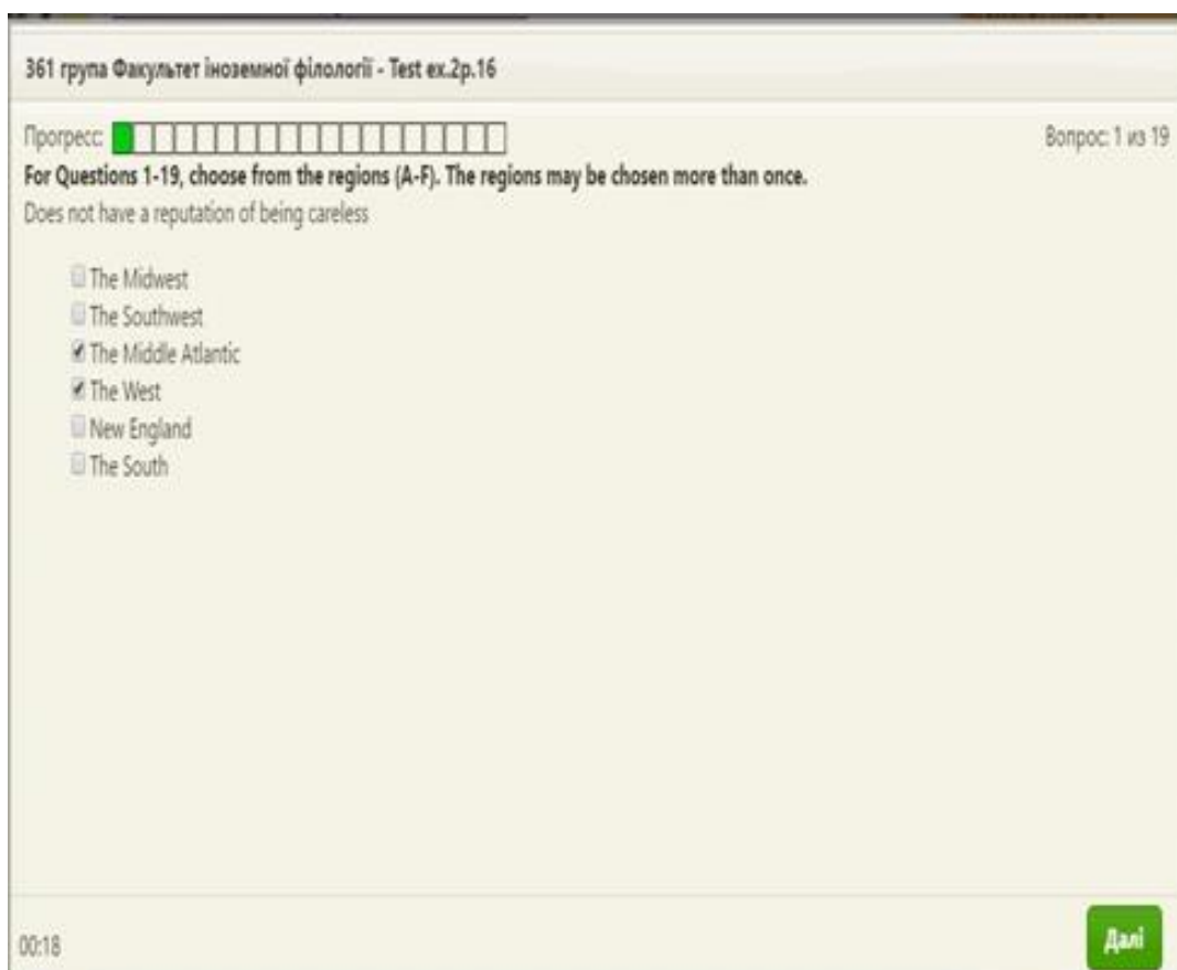
Fig.5. Post-reading exercise «One from many»

Post-reading exercise «One from many» is presented.