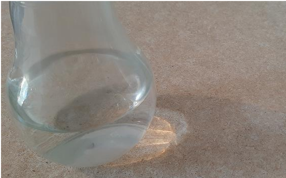
Fig. 2. A water glass with a caustic

8) The radiance caching allowed several times faster visualization, since only a small part of the points visible through pixels. The radiance is calculated by tracing the rays along the hemisphere, and at other points, it is extrapolated.