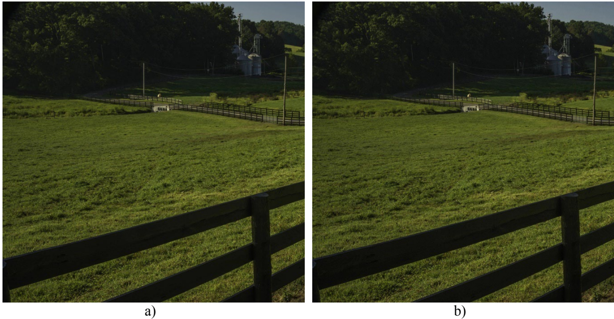
Fig. 3. An example of an original image (a) and a steganographic message (b) obtained using a steganographic method with code control of additional information embedding and blind decoding.

Analysis of the data presented in Table 5 shows that the steganographic method with code control of additional information embedding and blind decoding under the influence of a compression attack with the value QF=70 , which is usual for most modern digital image transmission systems, allows to ensure 2.47% of