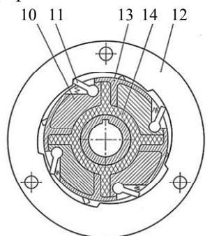
Fig. 1. Scheme of two-rotors combined turbine drive with transmission for the NPP water supply emergency system pumping unit