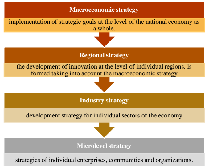
Fig. 2. Hierarchy of innovative strategies [10-11].

Micro-level strategy , this type includes strategies of individual enterprises, communities and organizations.